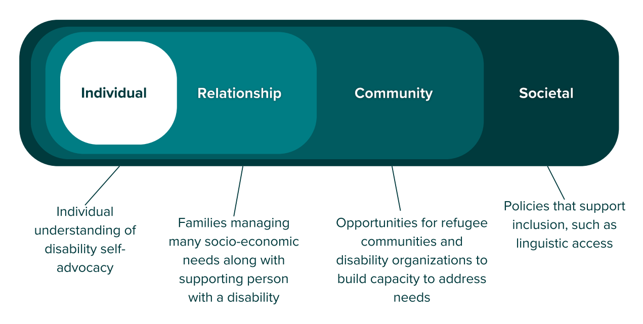
Figure 4: The social-ecological model with examples of characteristics that may be part of each level.

The team conducted in-depth interviews (N=9) with dyads (person with a disability and supporter) and one triad (two family members and a person with a disability). Interviews centered on individual and family/supporter experiences within an social ecological model (Golden & Earp, 2012) which acknowledges the interactions of individuals and environments to produce health outcomes (Figure 4). Three interviewees with disabilities were over the age of 18 and no longer in school; one interviewee with a disability was under 18 and still in high school. The interviews were conducted in Kirundi (n=3), Somali (n=6) and English. Participants' length of time in the U.S. ranged from 8 to 19 years. Most interviews took place in Tucson (n=7) and one took place in Phoenix (n=2). The interviews were recorded with permission and transcribed for review by a team of three researchers (JA, JF, and DF) to identify common themes.