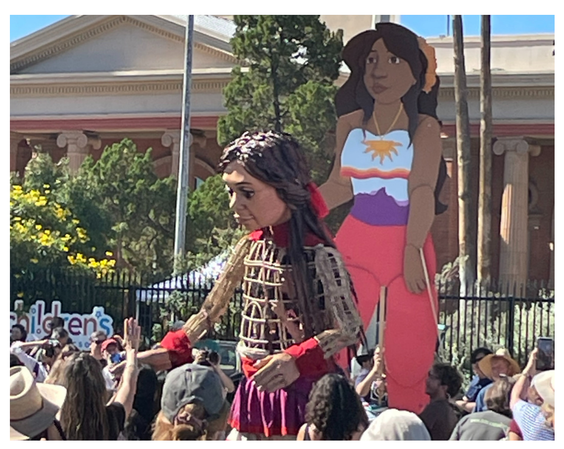
Amal is a 12-foot puppet of a 10-year-old Syrian refugee, who visited Tucson, Arizona in October 2023. For more information about her journey, visit <a href="https://www.walkwithamal.org/">https://www.walkwithamal.org/</a>

The central goal of this project was to understand how policies and practices within and around the disability service system affect accessibility of these services for refugees with disabilities. This project centers the experiences of refugees themselves. The project's findings highlight the broad and diverse population of refugees with disabilities in the state of Arizona, with a focus on Tucson and Phoenix, the primary resettlement areas. This report builds on ADDPC's 2018 report, which focused on the perspectives of service providers, to include input from refugees with lived experience. The study team used a number of complementary data collection methods to better understand and illuminate the experiences of refugees with disabilities in Arizona.